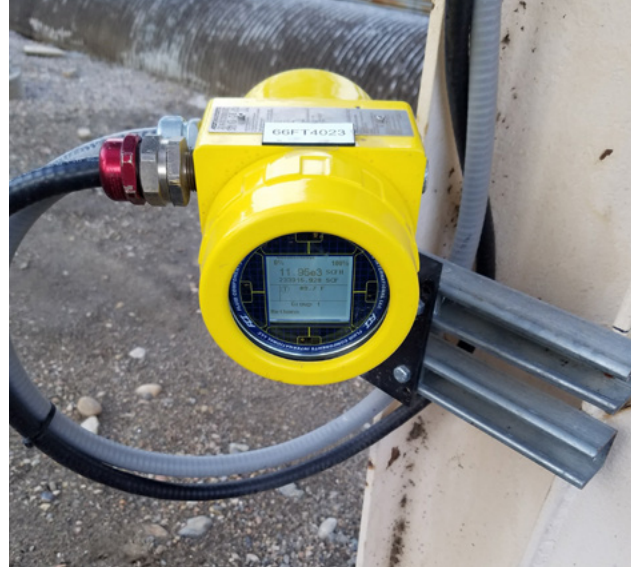
Figure 2: FCI ST100 Series flow meters

The single-point version of the meter was recommended for the refinery's SRU air main header line and the tail gas line. It provides the best accuracy for pipe diameters from 8 inches to 12 inches. In line sizes larger than 12 inches or where a line's air/gas flow profile is unstable, a dual-point meter configuration is recommended for the best accuracy. This dual-point meter's transmitter integral or remote electronics average the input of two independent flow elements to provide the required accuracy and repeatability.