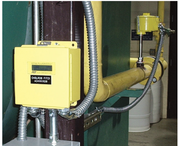
Figure 2: Installed FCI Model ST98 flow meter with Vortab flow conditioner