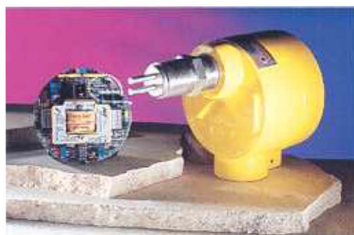
FIG. 4: The switch's control circuit is a fail-safe, dual-relay circuit board that is user friendly. Sensing elements are constructed of stainless steel, Hastelloy C276, Monel, or Titanium.

drawbacks. Delta-P sensors require a special low-signal transmitter that's highly sensitive and often expensive. Turbine-type flowmeters feature a delicate sensor that easily fouls and outputs weak pulses that are subject to electrical disturbances.