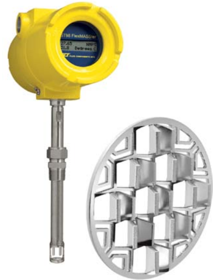
Figure 4: ST98 with Vortab VIP

Outfitting wastewater treatment aeration systems such as this city's plant with a mass flow meter will result in improved process effectiveness and reduced energy consumption. Looking carefully at measuring accuracy and range needs, installation conditions and maintenance requirements will assist in selecting the most cost effective flow metering solution.