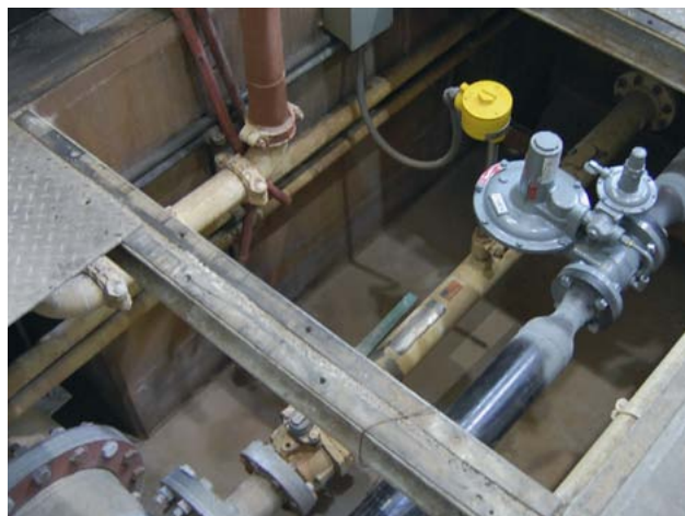
Figure 1: WWT Plant Underground Vault With FCI ST98 flow meter

In most plants, each of several aeration basins is configured with numerous diffuser systems, and individual air flow monitoring with independent control is generally required for each diffuser system. The compressor system