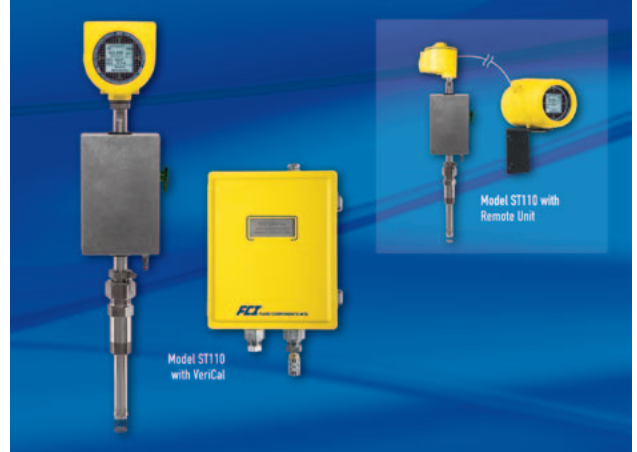
Figure 2. ST110 Air/Gas Flow Meter

Designed for demanding oil/gas industry applications, the ST110 flow meter operates at up to 850°F (454°C) and is available with both integral and remote (up to 1000 feet [300 meters]) electronics versions. The ST110 includes system wide agency approvals for hazardous environments, and a rugged, NEMA 4X/IP67 rated 316 stainless steel enclosure. Approvals include SIL-1, ATEX, IECEx, FM and FMc.