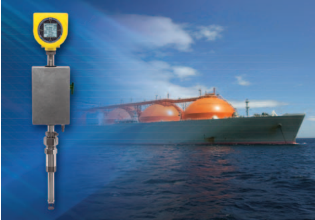
Figure 1. LNG Tanker