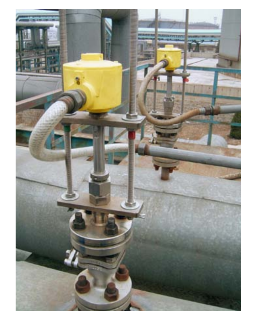
Figure 4: ST110 Flow Meter with packing gland

Until now, validating the calibration of a gas flow meter has been extremely expensive because it meant either installing a second reference flow meter in the pipe line or removing the meter from the pipeline altogether and returning it to the manufacturer. The latter option could also mean purchasing a spare meter to use while the first unit was offsite as well as paying the costs of the additional testing and shipping.