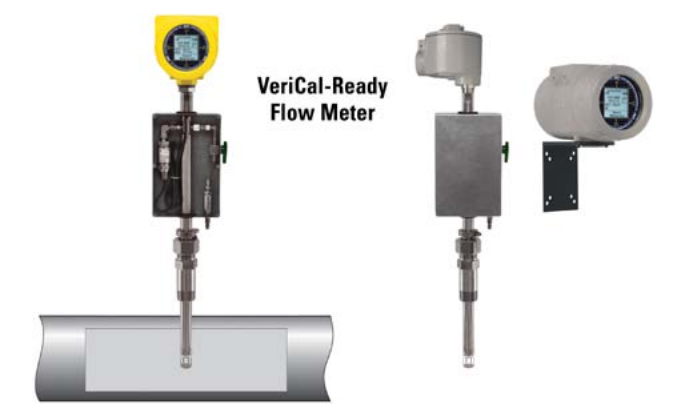
Figure 2: FCI ST110 Flow Meter

conventional differential pressure (DP) measurement across an orifice plate operates over 5:1 turndown, an ultrasonic flow meter withstands a 40:1 turndown.