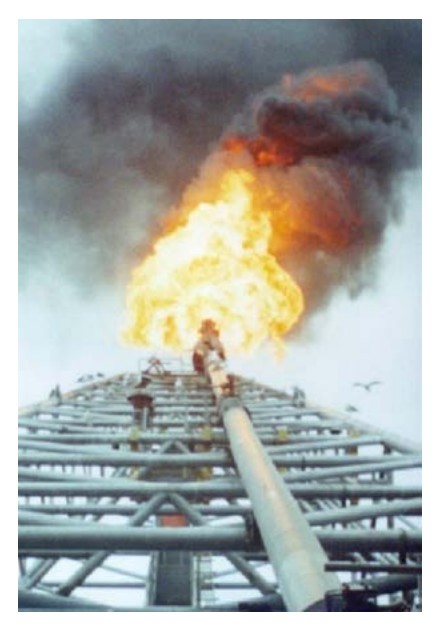
Figure 1: Typical offshore flare stack

Flare gas is the name given to the surplus waste gas produced during the extraction of crude oil and the subsequent refining process. It is typically vented to atmosphere and burned in a flare stack ( Figure 1 ). The process inevitably releases large quantities of carbon dioxide ( CO_2 ) to the atmosphere, which is a major contributor to global warming.