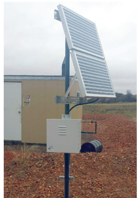
Figure 1: Solar power system at well site

Jasper Engineering then helped the Legacy Reserves site team design their new solar powered system for the flow meters and additional components. The system utilizes two 50 Watt panels to provide 24 hour power, even during the cold Dakota winters on cloudy or snowy days. The team chose two large 12 Volt, 40 Amp hour backup batteries that are housed in a rugged 16 x 16 x 10 inch enclosure ( Figure 1 ).