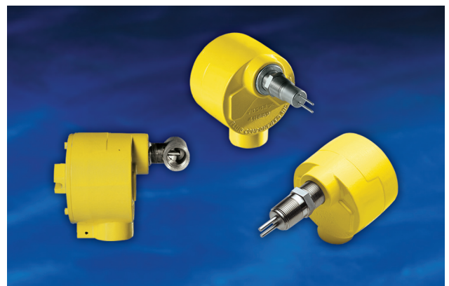
Figure 3. FCI's FlexSwitch FLT Series offers a robust scheme for pump protection with features such as dual alarm capability.

Many types of point flow switches are available. For example, the FCI FlexSwitch® FLT Series, with its no moving parts design, offers a highly robust scheme for pump protection with its dual alarm capability (Figure 3). With Alarm 1, the switch will detect a low-flow situation anywhere between 0.01 and 3 feet per second (FPS) (.003 to .9 meters per second MPS). This low flow alarm can be regarded as a pre-warning signal for the control system or operator. Alarm 2 can be set at a no-flow condition. The system or operator can then decide to keep the pump running or