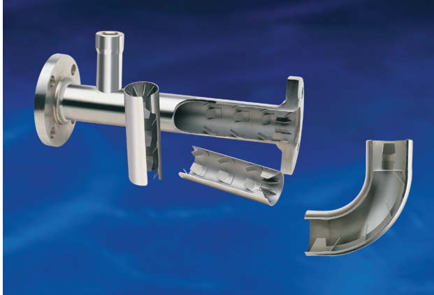
Figure 2. Vortab inline and elbow flow conditioners help eliminate upstream straight run requirements for pumps and other process equipment.

By Jim DeLee, Sr Member Technical Staff Fluid Components International