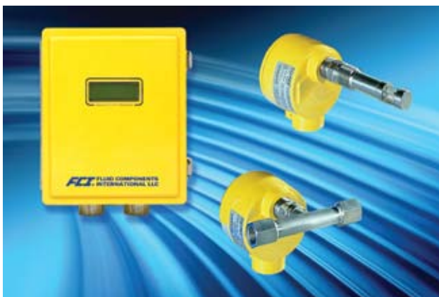
Figure 1. GF90 Gas Mass Flow Meter

By Shawkat Alam, Sr. Member Technical Staff Fluid Components International