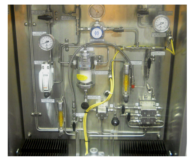
Figures 5 & 6: FS10A in remote configuration; hot process sampling system (VAM/new shelter)

Sam Kresch, Fluid Components International (FCI)