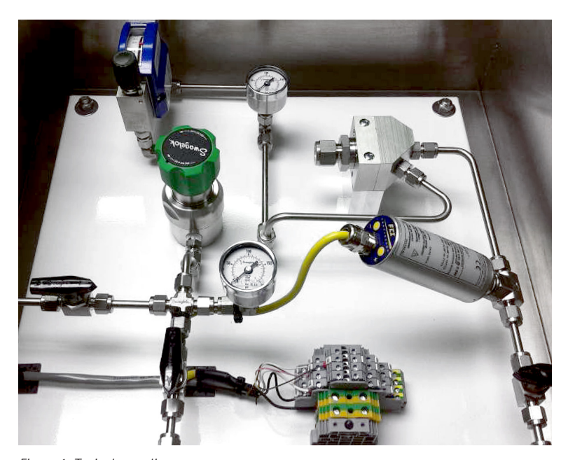
Figure 1: Typical sampling system

While there are a number of fluid flow monitoring technologies on the market, immersible thermal dispersion technology combined with packaging and sensor designs optimized for sampling systems has emerged as the new bestin-class technology. Thermal dispersion mass flow sensors have proven themselves for decades as extremely reliable in other demanding process and plant applications—often in relatively close proximity to analyzer systems.