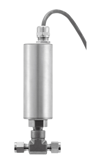
Figure 4: FS10A in tube tee

There are two major types of thermal devices on the market. One type utilizes a capillary bypass technique and is better known as a Mass Flow Controller or MFC. MFC's divert a portion of the main flow into a small bypass and sense the heat transfer of flowing fluid in the bypass channel. This technique can be very effective; however, the capillary tube is highly susceptible to contamination and clogging and should only be considered for use with clean or pre-filtered fluids. Capillary bypass flow