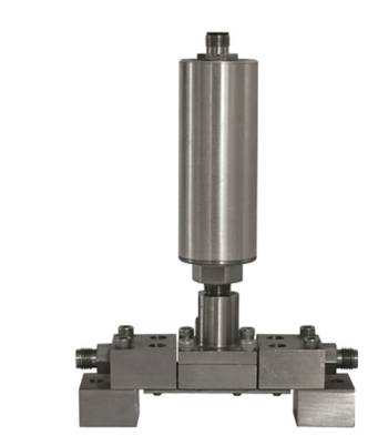
Figure 2: FS10A mounted in SP76 manifold