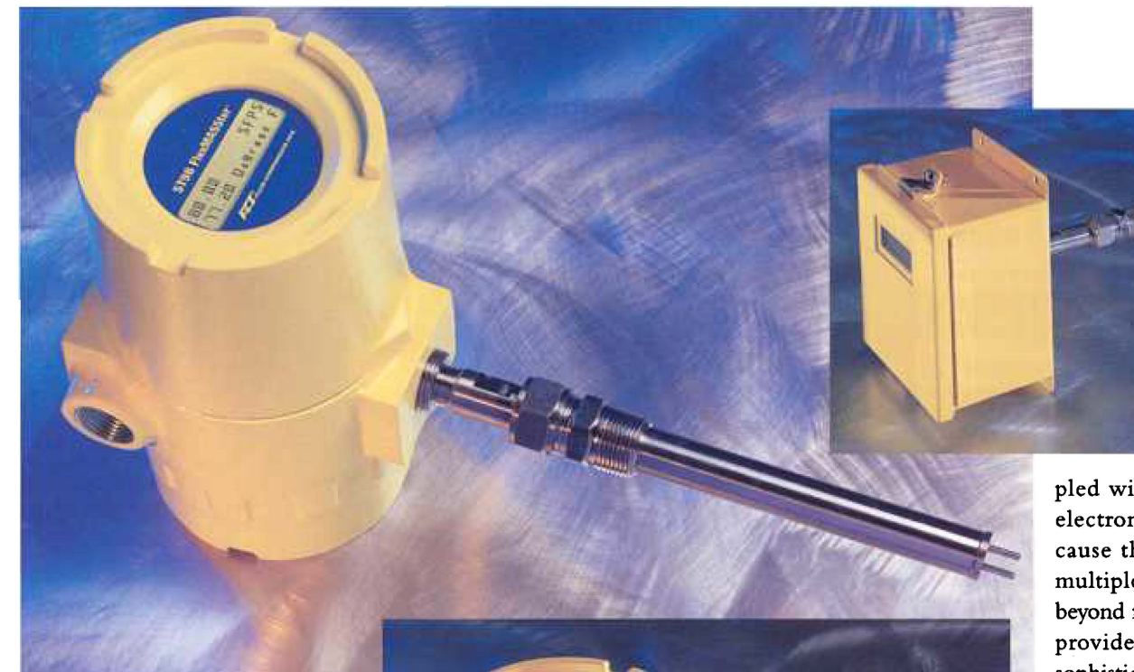
Mass flowmeters offer great accuracy and repeatability.

not only measure mass flow, but can also measure volumetric flow, density, temperature and fraction-flow. They offer exceptional accuracy to 0.1% of actual flow and repeatability to 0.05%. Unaffected by variations in pressure, temperature, density, electrical