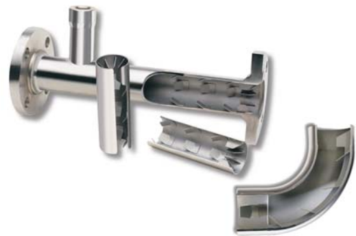
Fig. 2. Tube and Elbow Tab-Type Conditioner Cut-Away View

The standard straight tube Vortab® Flow Conditioner consists of pipe fitted with a short section of swirl reduction tabs combined with three arrays of profile conditioning tabs. The combination of anti-swirl and profile conditioning tabs creates a repeatable, flat velocity profile at the outlet of the pipe. This same tab-type flow conditioning technology also can be designed into an elbow flow conditioner (Fig 2).