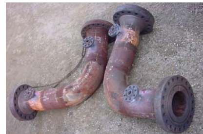
Fig. 3. Elbows for Offshore Oil Pumping Station

Tab type flow conditioners are suitable for application in many different processes. For example, at an offshore oil pumping station the process engineering team needed to add a pump to increase capacity. Elbows feeding into the pump consisted of a 20-inch inlet and reduced down to a 12-inch section.