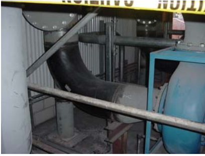
Fig. 4. Electric Power Plant Elbow and Pump

The tab-type flow conditioner placed in the elbow compensated for the lack of straight run and provided an equally distributed flow profile entering the pumps.