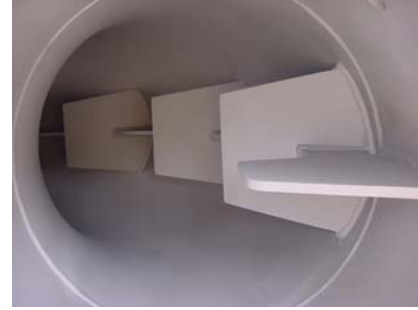
Fig.5. Elbow Flow Conditioner, Interior View

A natural gas producer faced a space limitation problem when retrofitting a pipeline pumping station with a new compressor (Fig 5). Achieving the proper upstream straight pump run required for the 3500 hp compressor would have necessitated the removal of existing underground pipe at substantial expense. Instead of digging their way out of this problem, a tab-type flow conditioner was plumbed directly into the compressor's inlet.