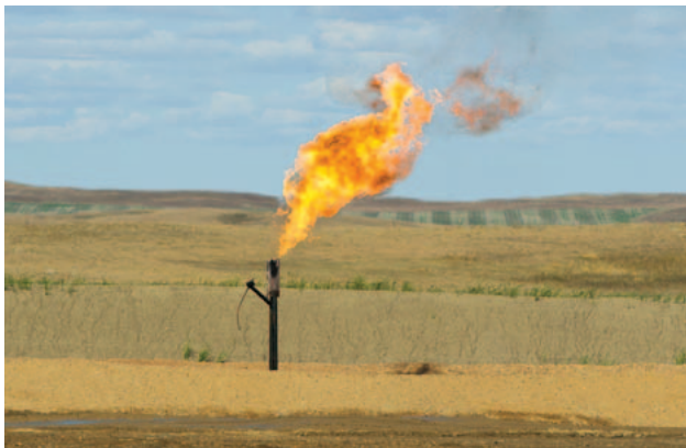
Figure 3: ST100 Series display close-up view

By Steve Cox, Sr. Member, Technical Staff, Fluid Components International (FCI)