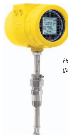
Figure 2: ST100 Series thermal mass gas flow meter

The mud logging service company engineers contacted Fluid Components International (FCI) for a possible solution. After analyzing the process requirements, the applications team at FCI recommended the company's ST100 Series thermal mass gas flow meter (Figure 2), which provides acceptable accuracy at low flow rates combined with a turndown far in excess of 100:1. The meter also includes integral data logging, and the meter's insertion style probe offered low pressure drop.