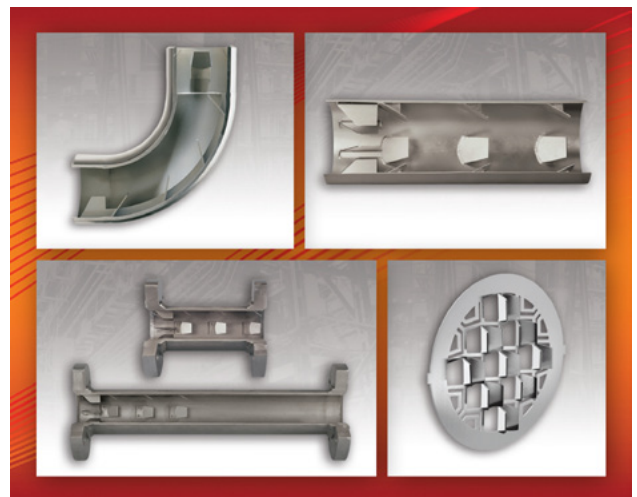
Figure 2. Vortab flow conditioners

When looking for ways to decrease process costs, enhancing the flow instrumentation accuracy may be a solution. This does not always mean purchasing a new flow meter or a new switch, though that may be the best solution. Can the same results be achieved by adding a flow conditioner instead? If a new flow instrument must be purchased, can a flow conditioner reduce the required installation space, piping and total installed cost? ■