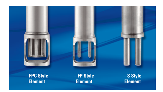
Figure 3: Multiple Sensor Heads

The ST100 Series is comprised of two core model families: the ST and STP. The ST family measures both mass flow and temperature, and the exclusive STP family adds a third parameter—pressure. The STP configuration makes the ST100 the world's first triple-variable thermal flow meter, measuring flow, temperature and pressure. Both families include singlepoint and dual-element models as configurations outfitted with FCI's exclusive in-situ calibration option, VeriCal.