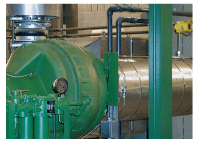
Figure 1: Ozone Treatment System

By Stephen Cox, Sr. Member Technical Staff Fluid Components International