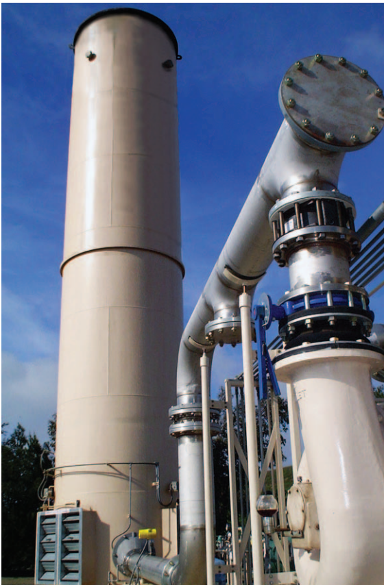
Figure 2: FCI Model ST98 mass flow meter in a landfill gas system

The gas flow rates can be widely variable depending on the volume of refuse and seasonal changes in temperature and humidity, which means instrumentation and other equipment must be able to measure effectively with wide swings in gas flow. Therefore a flow meter with a wide turndown is essential. Another consideration for flow meter selection is its capability to support different or changing gas compositions. A flow meter with on-board storage of multiple calibrations that can be user assigned in the field is ideal, but a flow meter manufacturer with field service technician's who can perform site calibration verification and adjustments is an acceptable alternative.