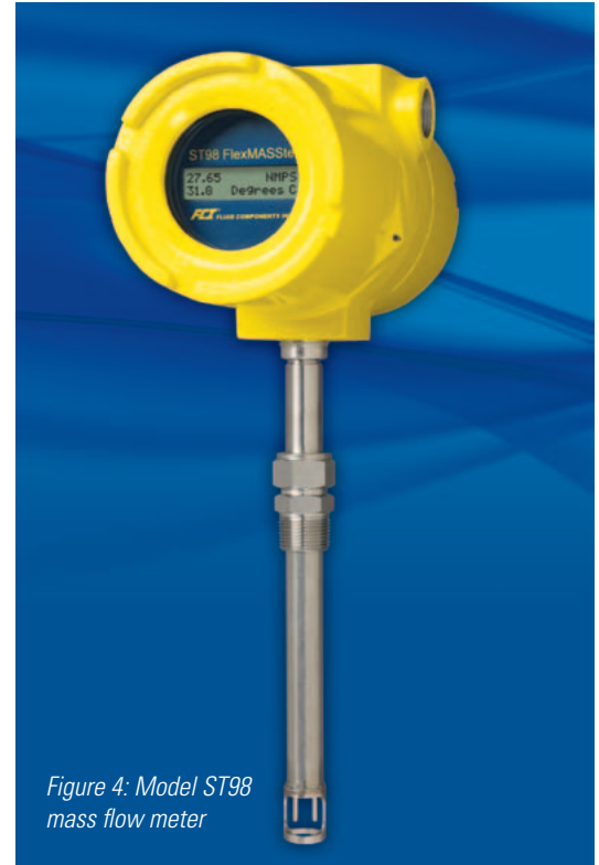
Figure 4: Model ST98 mass flow meter