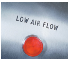
Figure 2: Know your flow range

One of the compelling features of thermal flow meters is their wide turndown capability (Figure 2). Typical turndown for most manufacturers is 100:1. Flow range capabilities are a big differentiator between suppliers and technology. Typical CT type technology meters have less range than CP type devices due to sensor power limitations. However, some manufacturers have special techniques to extend their measuring ranges up to 1000 fps [300 mps].