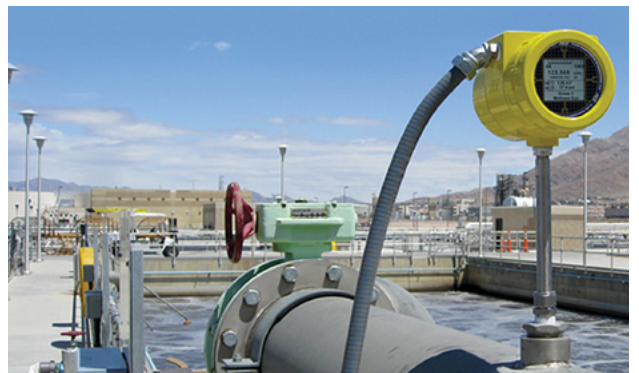
Figure 5: In outdoor, harsh desert sunlight, know the ambient conditions of your installation location