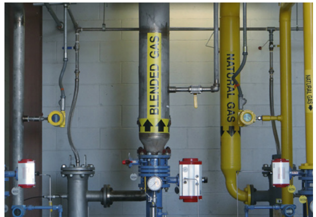
Figure 1: Knowing gas type is required to specify a thermal flow meter

the calibration process they will apply before you commit to purchase.