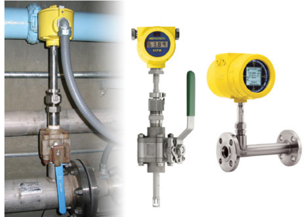
Figure 6: What is the required mechanical connection to pipe?

Often overlooked during initial considerations and application suitability are requirements for certifications and qualifications beyond the basic meter performance. This might include such things as pressure tests, certified materials and traceability, positive material identification report, and/or welding pedigree and certificates. If the