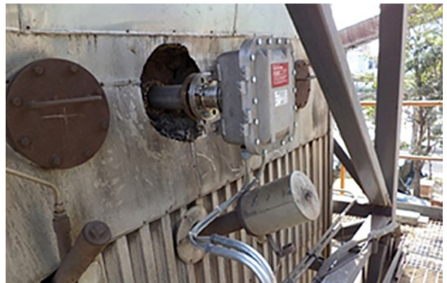
Figure 3, top: Small diameter piping situations can require a different type of connection configuration.