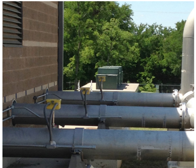
Figure 4: Consider meter flow straight-run requirements and flow disturbers