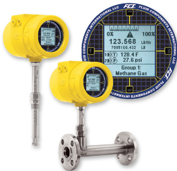
Figure 1: FCI ST100 Series Thermal Air/Gas Flow Meter

For example, the ST100 Series Thermal Flow Meter (Figure 1) from Fluid Components International (FCI) consists of an easy to install insertion flow element with a rugged and powerful electronics/transmitter. With specific calibrations for mixed gas compositions, if needed, the split-range/dual calibration feature with (3)4-20 mA analog outputs or digital bus communications (HART, FOUNDATION™ Fieldbus, PROFIBUS or Modbus) make it ideal for flare applications