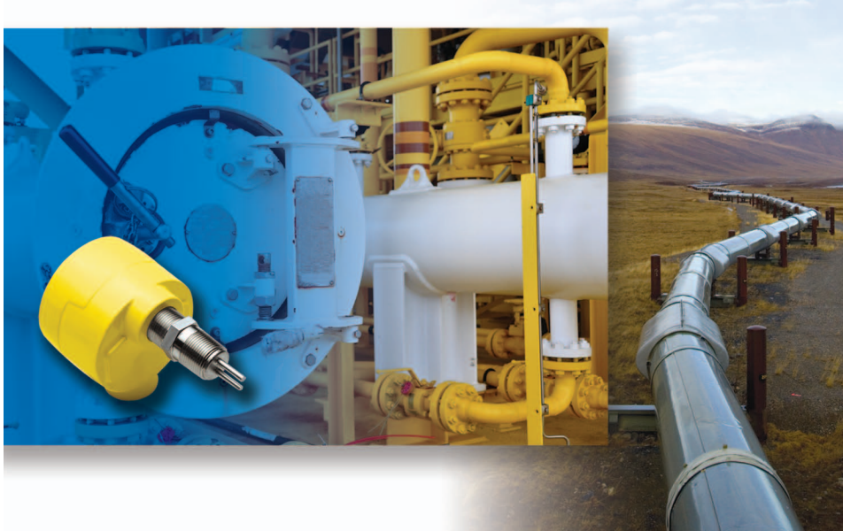
Figure 1: Trans-Alaska Pipeline System (TAPS)

A major oil producer in Alaska's North Slope region operates miles of transit pipeline as part of the Trans-Alaska Pipeline System (TAPS) within the U.S. National Petroleum Reserve—Alaska. The TAPS pipeline transports petroleum extracted from the North Slope southward to the port of Valdez for shipping by tanker to West Coast refineries.