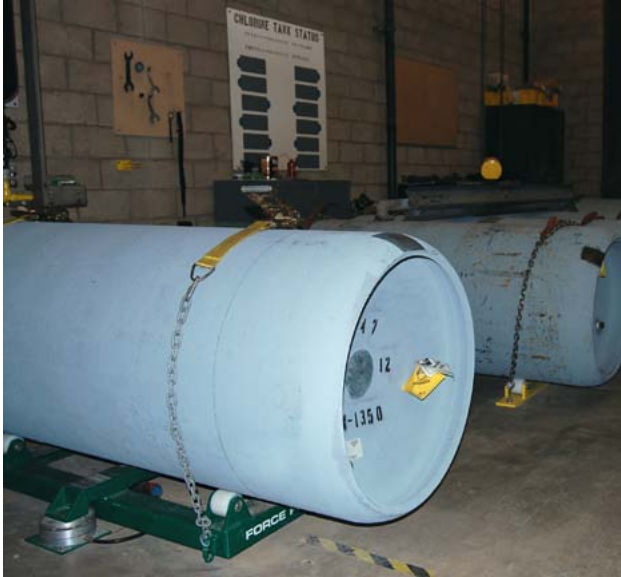
Figure 1: Water treatment plant chlorine tanks

Steve Cox, Senior Technical Staff, Fluid Components International (FCI)