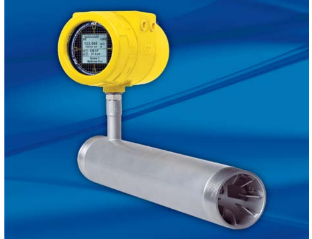
ST100L Flow Meter with Vortab Flow Conditioner

The ST100L flow meters have been installed in the chlorine gas inlet lines and achieving consistent accurate and repeatable flow measurement results. The site is achieving the desired disinfection results with proper chlorine dosing at significant cost savings due to reduced chlorine use, avoiding re-treatment and lessened residual chlorine removal processes. ■