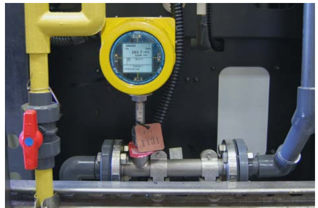
Figure 2: Installed ST100L Flow Meter with Vortab Flow Conditioner

The treatment plant needed a better gas flow meter solution that would be appropriate for service in a 1-inch diameter pipe at a flow rate of 150 lb/day to 2,000 lb/day [68 kg/day to 907 kg/day]. The operating temperature was 60 °F to 100 °F [16 °C to 38 °C] at a pressure of 0 psig to 10 psig [0 bar(g) to 0.7 bar(g)]. The flow meter would be used to measure chlorine and no other gases and would be installed in a location where inadequate straight-pipe run was present and added to the accuracy challenge for any velocity based instrument. The flow velocities also resulted in measurement required in the transitional zone where the gas flow profile was transitioning from laminar to turbulent. Mass flow provided an additional advantage of allowing a simple, direct means of reconciling monthly throughput compared against the change in weight of the chlorine gas containers that were installed on load cell technology scales.