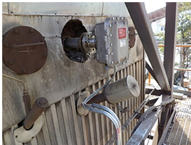
Flue gas monitoring at a cement plant

By looking at these factors as well as the plant's layout, environmental conditions, maintenance schedules, energy cost and ROI, it will soon be easy to narrow the field. The most common flow sensing technologies chosen for flue gas measurement are differential pressure (averaging pitot tubes) flow meters and thermal dispersion mass flow meters. Both technologies have similar accuracy levels when configured with multiple sensing points within the large cross sectional area of a flue gas line.