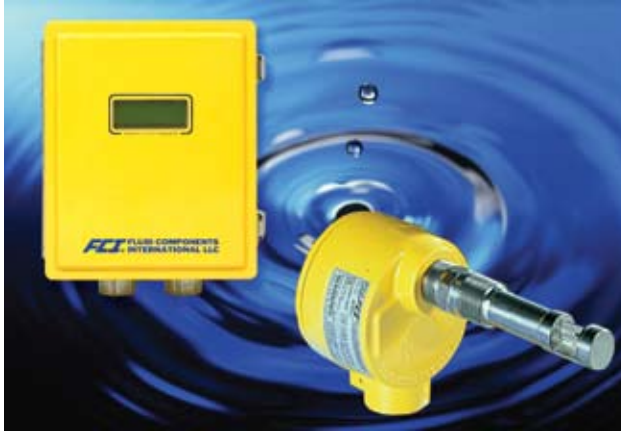
Figure 1. Thermal Mass Flow Meter