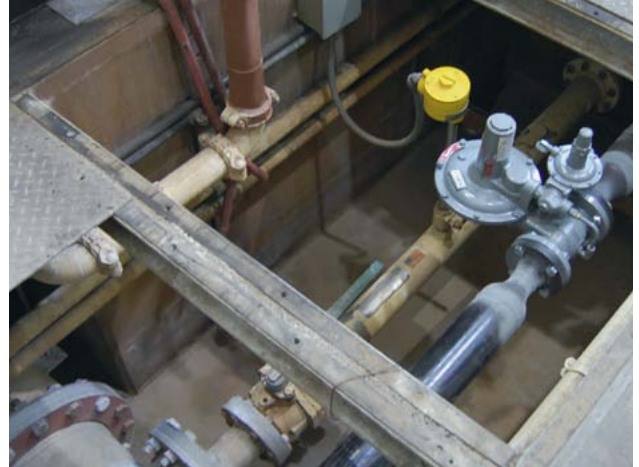
Figure 1: WWT Plant Underground Vault With FCI ST98 flow meter

In most plants, each of several aeration basins is configured with numerous diffuser systems, and individual air flow monitoring with independent control is generally required for each diffuser system. The compressor system