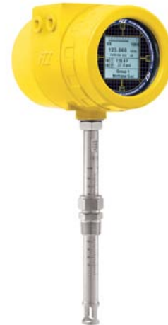
Figure 3: ST100 Flow Meter

The mining operator contacted the process applications team at Fluid Components International (FCI) for advice about its compressed air measurement accuracy problem. The FCI team