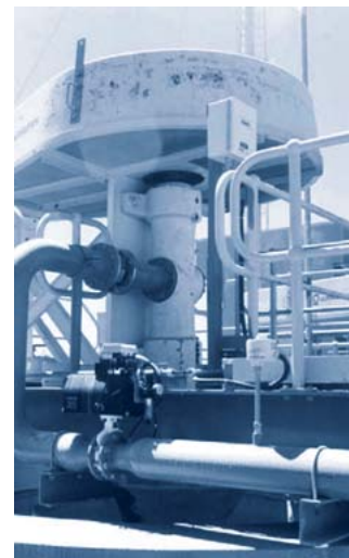
Figure 2: Froth flotation cell installation

In this case, the mining operator's frother cell utilized 3-, 4- and 6-inch compressed air lines (Figure 2). The mining operator's process review had revealed that the amount of unobstructed pipe straight run was insufficient and affecting the accuracy of the flow meters.