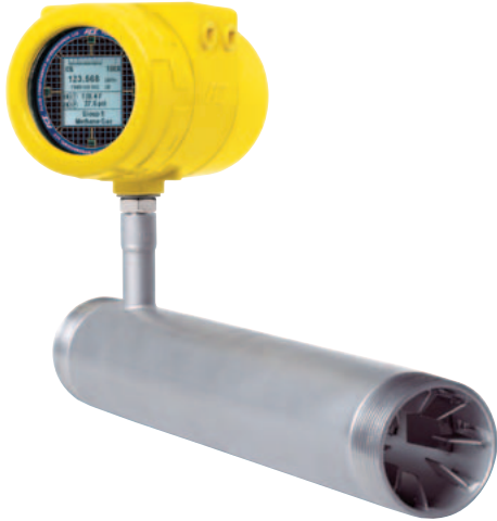
Figure 2: ST100L FM With Vortab Flow Conditioner