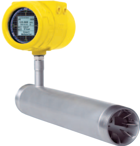
Figure 2: ST100L FM With Vortab Flow Conditioner