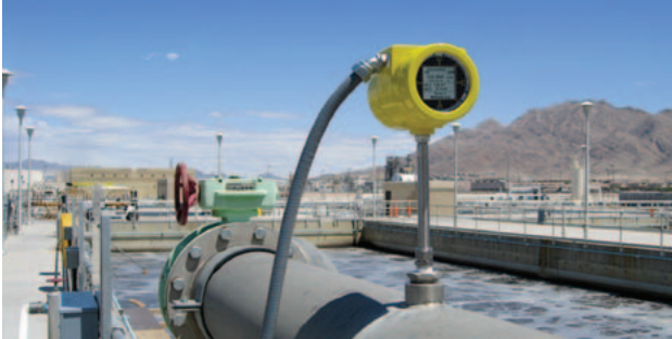
Figure 1. FCI ST100 Thermal Flow Meter at WWT Plant